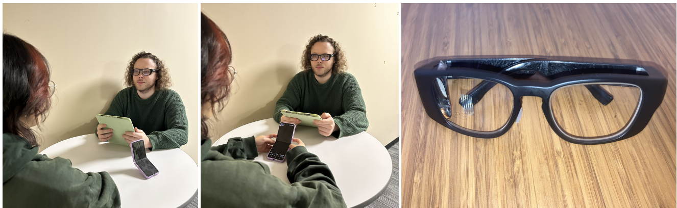
Figure 1: Left: Hearing participant cannot see captions. Center: Hearing participant can see captions. Right: tooz DevKit head-worn display.